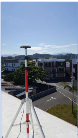
Semi-permanent Reference Station

Network Mode: Fully support NTRIP protocol