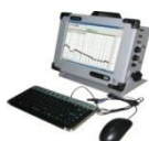
Echo Sounder SDE-28S+ and navigation software PowerNAV